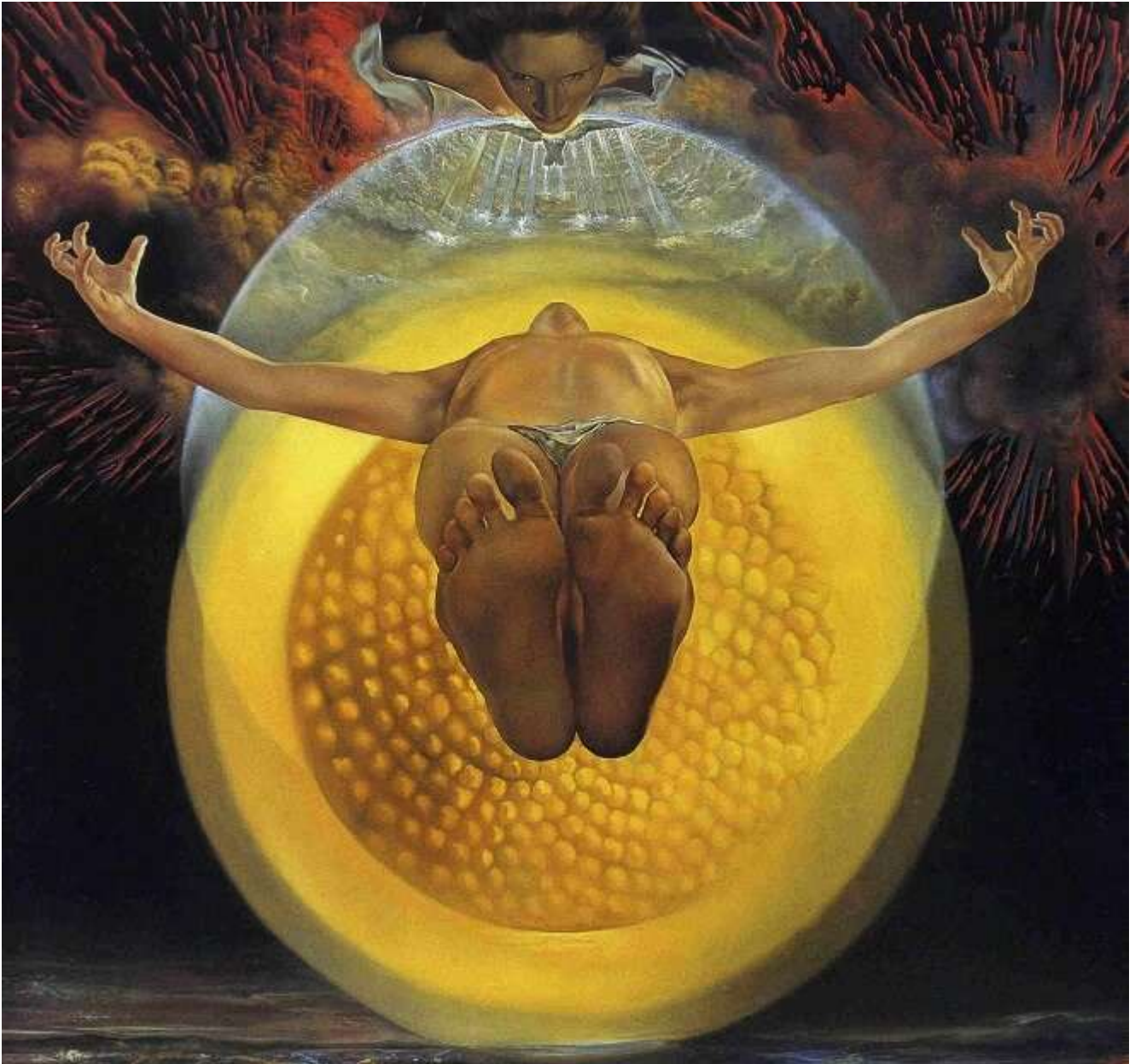
The Ascension of Christ - Salvador Dali (1904-1989)

Lifting up his hands, Jesus blessed them.